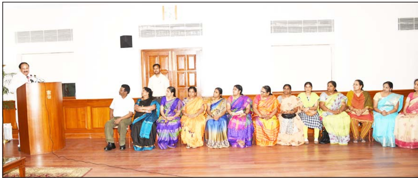
The Vice President, Shri M. Venkaiah Naidu addressing the officials working in AP Secretariat, in New Delhi on May 01, 2019.